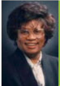
Joycelyn Elders, MD FORMER SURGEON GENERAL OF THE UNITED STATES Little Rock, Arkansas