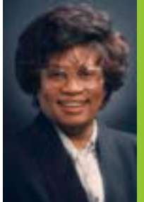
Joycelyn Elders, MD FORMER SURGEON GENERAL OF THE UNITED STATES Little Rock, Arkansas