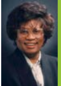
Joycelyn Elders, MD FORMER SURGEON GENERAL OF THE UNITED STATES Little Rock, Arkansas